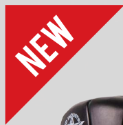
SRQ2 - Hyperspot